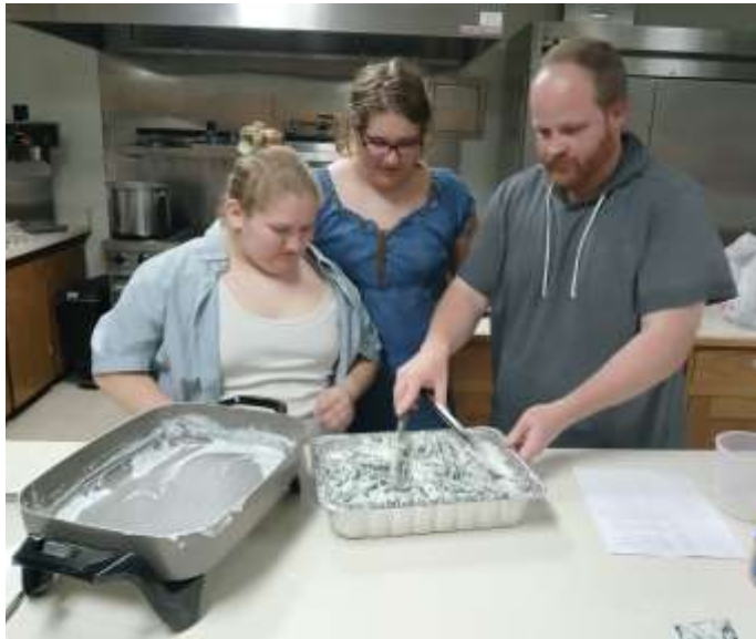
Our G-1 Youth kiddos learning how to help prepare Thanksgiving side dishes.